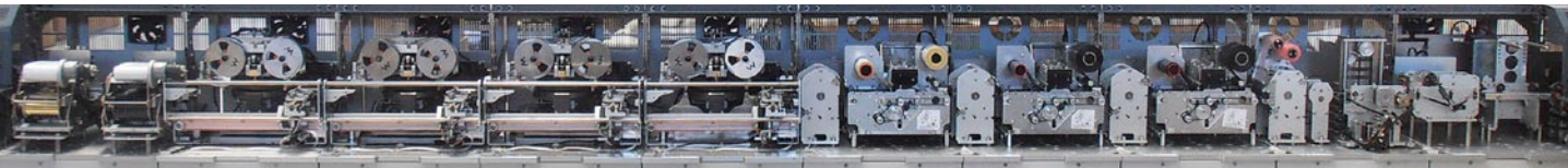
EXAMPLE OF THE S7000 CONFIGURATION