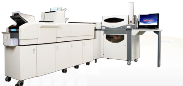
AVAILABLE WITH THE MS7000 MAILING SYSTEM IN-LINE & OFF-LINE